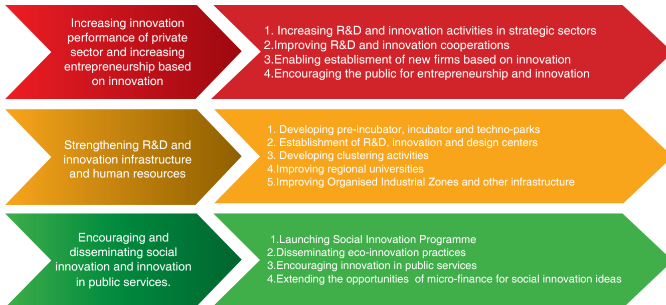
Figure 3. Strategic Breakthroughs of Regional Innovation Strategy of Middle Black Sea Region

Activities related to these are available in the parts below: